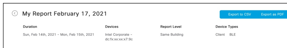
Figure 1: Report Header

The following are various components of a report: