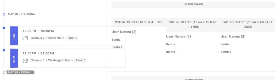
Figure 5: Day-Wise Journey

This part of the report visually traces the day-by-day journey of a reporting user across various buildings and floors of a campus, along with the time spent by the reporting person on each location.