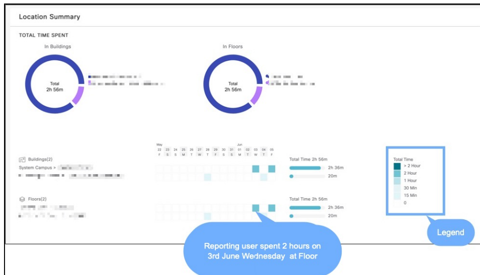
Figure 3: Location Summary