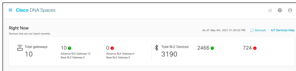
Figure 1: Right Now

In the Total BLE Devices part of this section, you can see an overview of all BLE devices that are being monitored. You can also see the number of reachable devices (base and advanced) counted under the green dot, and the number of unreachable devices counted under the red dot.