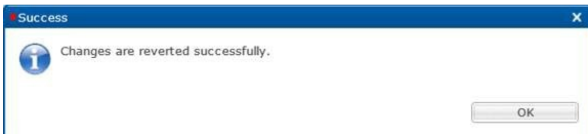
Figure 3: Success Confirmation Message