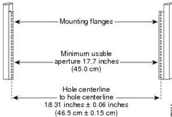
Figure 1: Verifying Equipment Rack Dimensions

Step 1 Mark and measure the distance between two holes on the left and right mounting rails. The distance should measure 18.31 inches \pm 0.06 inches (46.5 cm \pm 0.15 cm)