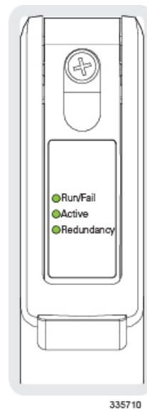
Figure 3: DPC Status LEDs

The possible states for all of the DPC/UDPC or /DPC2/UDPC2 LEDs are described in the sections that follow.