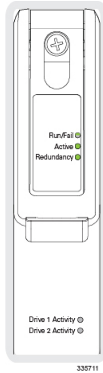
Figure 4: FSC Status LEDs

The possible states for all FSC LEDs are described in the sections that follow.