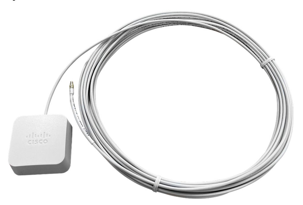
Figure 1: CW-ANT-GPS1-M-00-NS Antenna: Different Views

This document outlines the specifications for the Cisco Catalyst GNSS External Antenna (CW-ANT-GPS1-M-00) and provides instructions for mounting them. The antenna is designed for indoor or outdoor use depending on the country. CW-ANT-GPS1-M-00 is used on the CW-ACC-GPS1 accessory module. The primary use case for CW-ANT-GPS1-M-00 is as an indoor window mount. This antenna will provide geolocation information for the AP to be used by the AFC systems as required for standard power operation in 6-GHz band.