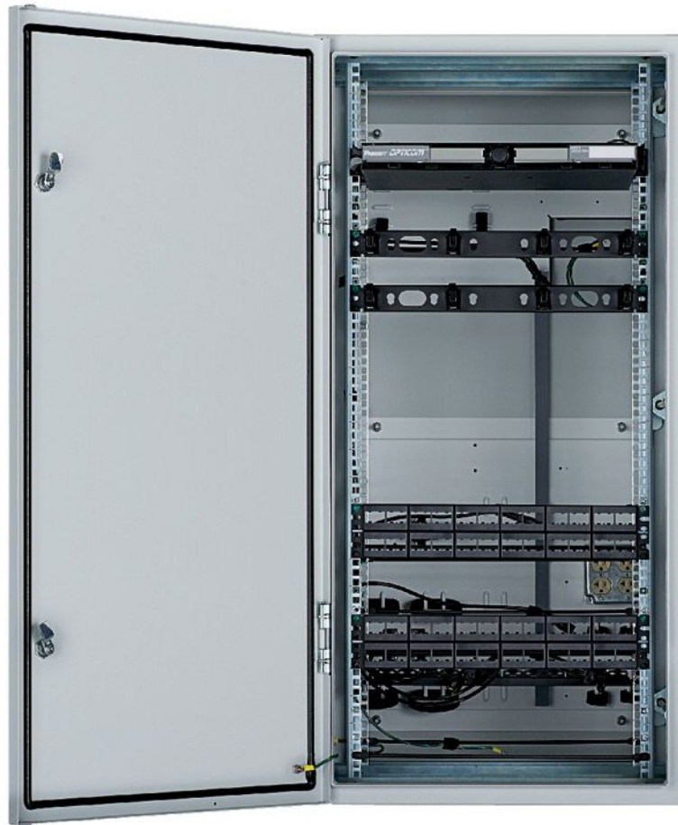
Figure 5 Panduit Pre-Configured IDF