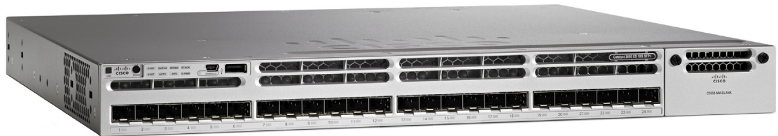
Figure 3 Cisco Catalyst 3850 Switch

To meet the demands of its network refresh and transition plan, the solution for the Costa Rica facility was to deploy a new Resilient Ethernet Protocol (REP) switch ring network (Figure 2). Cisco Catalyst 3850 distribution switches and Allen-Bradley Stratix 5400 industrial Ethernet switches were used for the REP ring switches. The Switch Ready Network Zone System, Pre-Configured Industrial Distribution Frame (IDF), and fiber and copper connectivity and accessories from Panduit were also installed. For more information on REP, see the Deploying A Resilient Converged Plantwide Ethernet Architecture Design and Implementation Guide ( www.panduit.com/cpwe ).