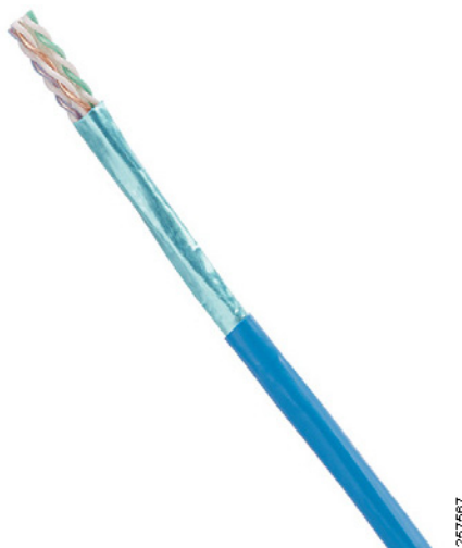
Figure 7 Panduit TX6A™ UTP Copper Cable with Vari-MaTriX Technology

The industrial network's backbone consists of OS2 single-mode fiber-optic cabling and enhanced Category 6A UTP copper cabling (Figure 7) with Vari-MaTriX Technology. Panduit OS2 single-mode fiber-optic cabling is an essential part of the Panduit end-to-end fiber-optic solution, designed to support today's data