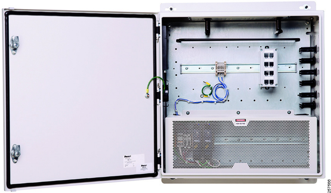
Figure 6 Panduit Switch Ready Network Zone System (PNZS)

The Panduit Switch Ready Network Zone System (PNZS) (Figure 6) allows for rapid deployment of the industrial networking equipment required to connect the plant floor. It includes copper and fiber connectivity, patching for the uplinks and downlinks, and a steel enclosure for reliability and improved security. It also includes power features to minimize engineering and installation time for faster implementation.