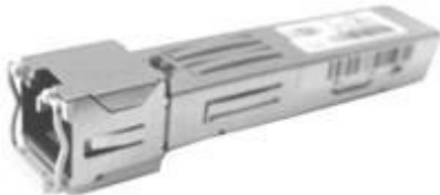
Figure 1: Cisco 1000BASE-T Copper SFP (GLC-T)

You can attach a monitor to the server, or, if Cisco Integrated Management Controller (CIMC) is configured, you can use a remote KVM (on UCS C220-M3 and C220-M4 servers).