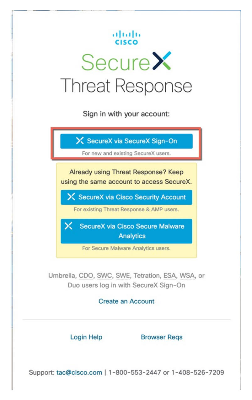
Figure 2: SecureX Sign-In