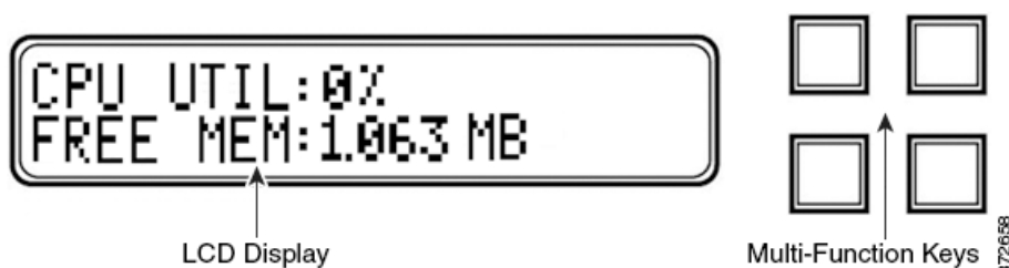
Figure 4-1 LCD Panel, Idle Display mode

In Idle Display mode, the panel alternates between displaying the CPU utilization and free memory available, and the chassis serial number. Press any key to interrupt the Idle Display mode and enter the LCD panel’s main menu where you can access Network Configuration, System Status, and Information modes.