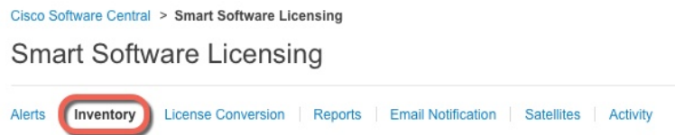
Figure 6: Inventory