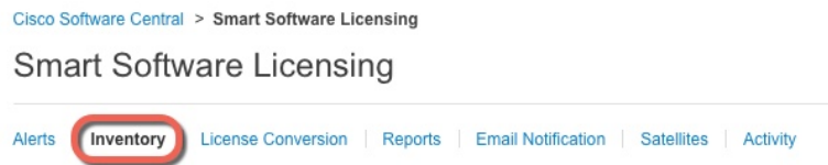
Figure 11: Inventory