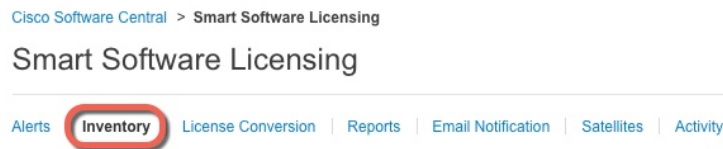
Figure 1: Inventory

b) On the General tab, click New Token .