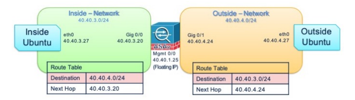
Figure 2: Sample ASAv on OpenStack Deployment