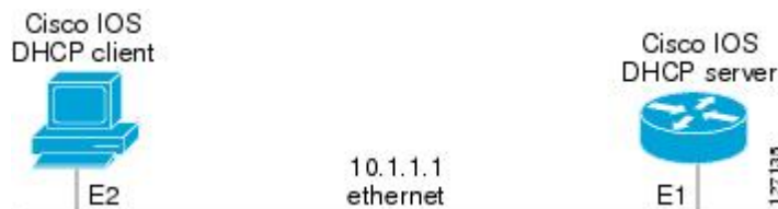
Figure 2: Topology Showing DHCP Client with GigabitEthernet Interface

On the DHCP server, the configuration is as follows: