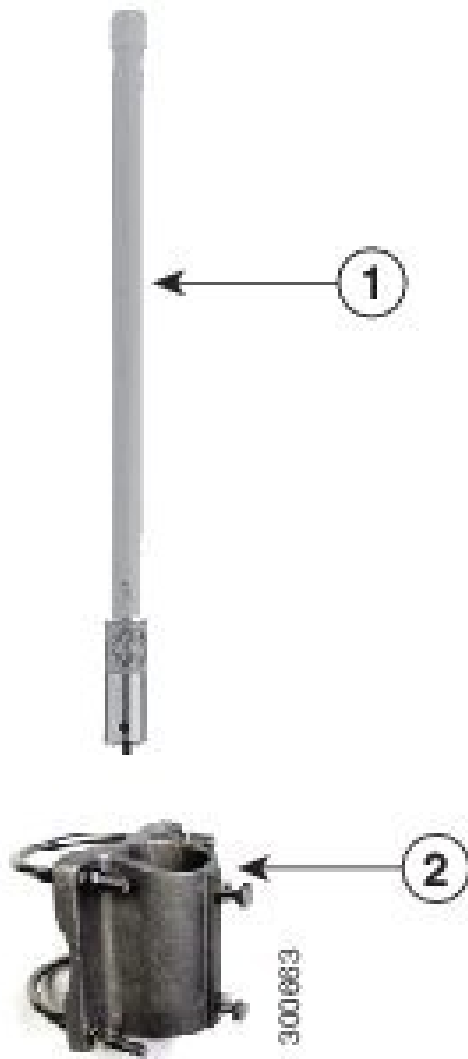
Figure 3: Antenna and Bracket