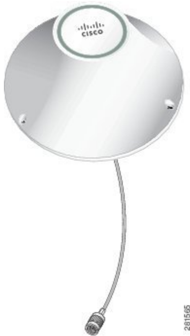
Figure 1: 4G Volcano Antenna