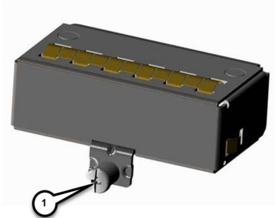
Figure 1: Latch Lock Screw

Step 2 Slide the blank plate out of the device.