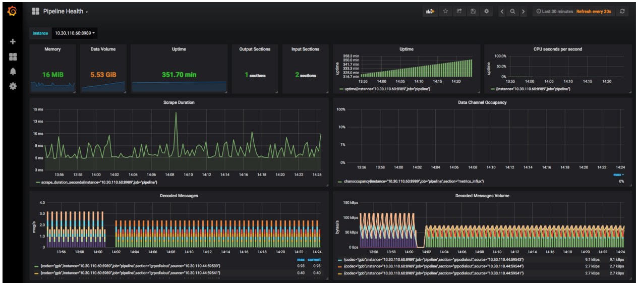
Figure 2: Visual Analysis of Network Health using Telemetry Data