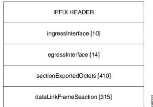
Figure 2: IPFIX 315 Export Packet Format

A special cache type called Immediate Aging is used while exporting the packets. Immediate Aging ensures that the flows are exported as soon as they are added to the cache. Use the command cache immediate in flow monitor map configuration to enable Immediate Aging cache type.