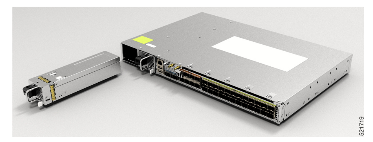
Figure 1: Install DC Power Supply Module for Cisco N540-2408L2DD-SYS