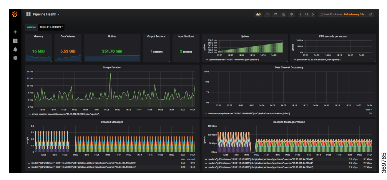
Figure 3: Visual Analysis of System Monitoring using Telemetry Data