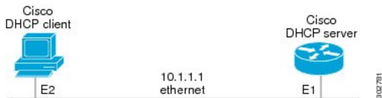
Figure 2: Topology Showing a DHCP Client with a Gigabit Ethernet Interface

On the DHCP server, the configuration is as follows: