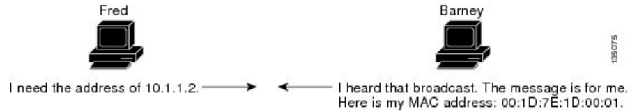
Figure 1: ARP Process

When the destination device lies on a remote network that is beyond another device, the process is the same except that the device that sends the data sends an ARP request for the MAC address of the default gateway. After the address is resolved and the default gateway receives the packet, the default gateway broadcasts the destination IP address over the networks connected to it. The device on the destination device network uses ARP to obtain the MAC address of the destination device and delivers the packet. ARP is enabled by default.