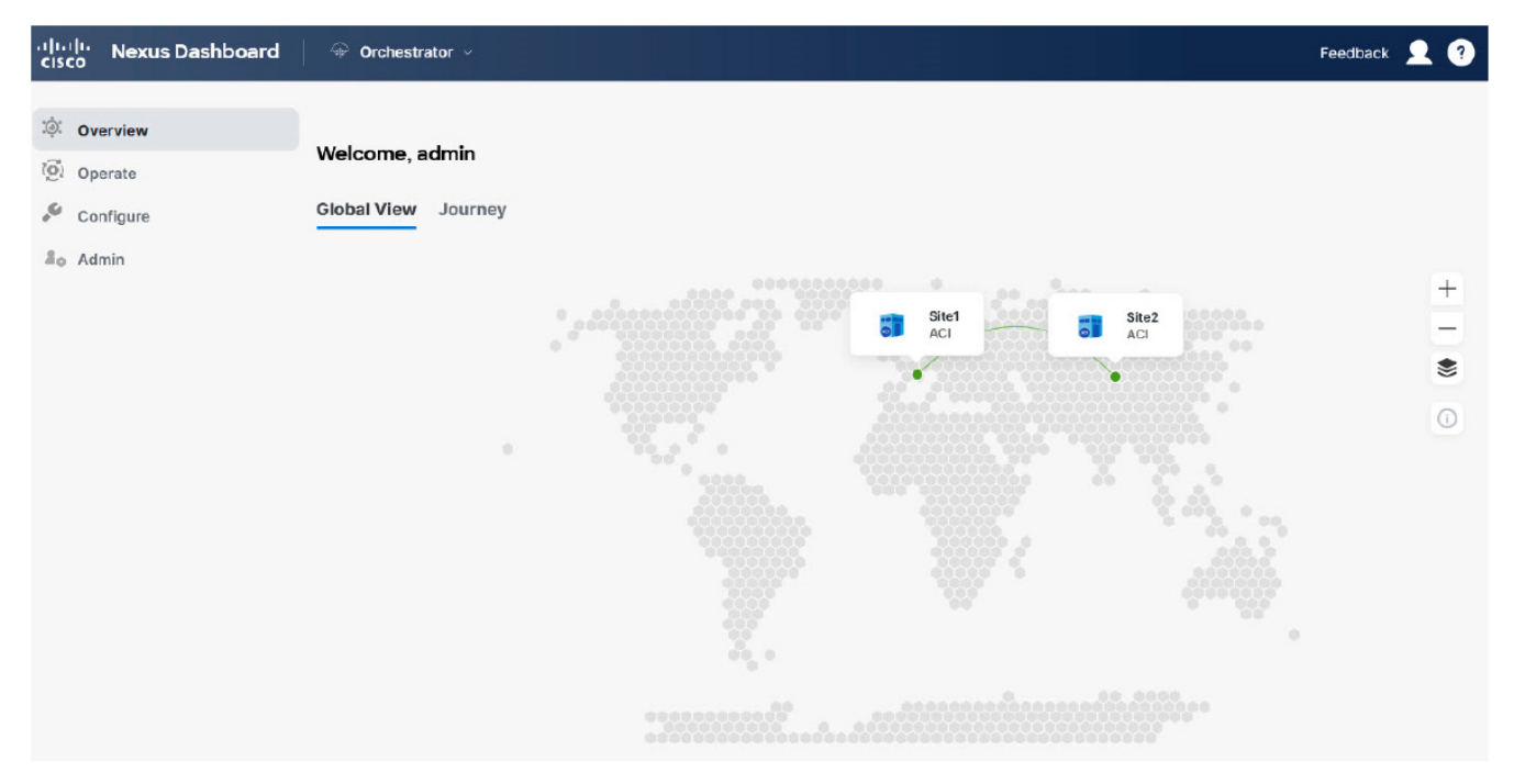
Figure 1. Cisco Nexus Dashboard Orchestrator

Functions like Operate contain fabrics and tenants operations, and Configure contains fabric to fabric connectivity, tenant configurations, and fabric templates. The Admin category contains functions like System Configurations, Integrations, and so on. The functionality of each NDO GUI page is described in specific chapters later in this document.