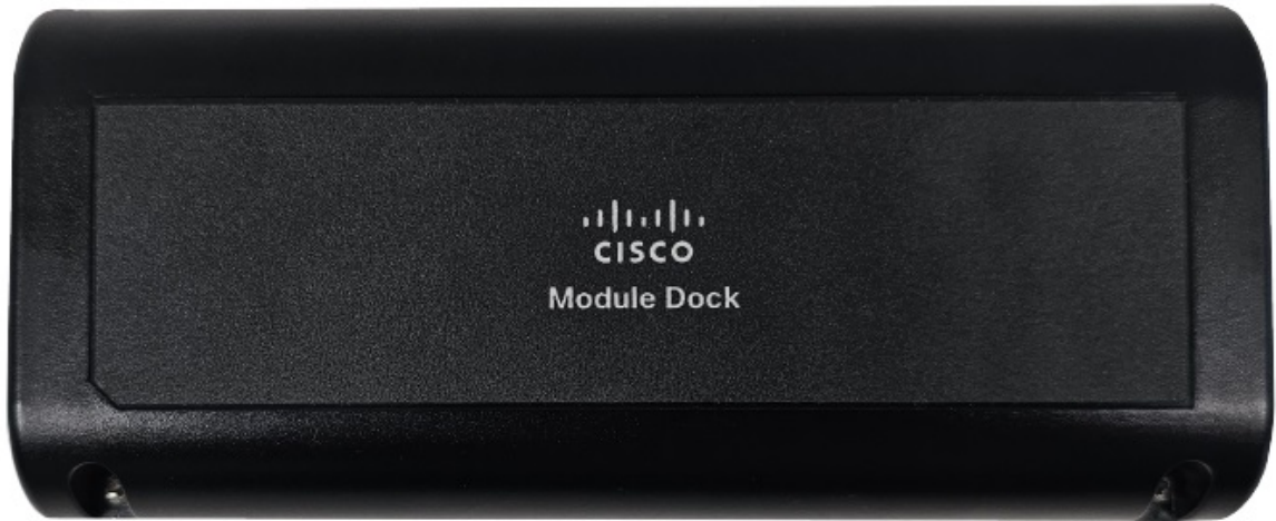
Figure 1: Cisco Provider Connectivity Assurance Module Dock

The following table lists the features for the Module Dock.