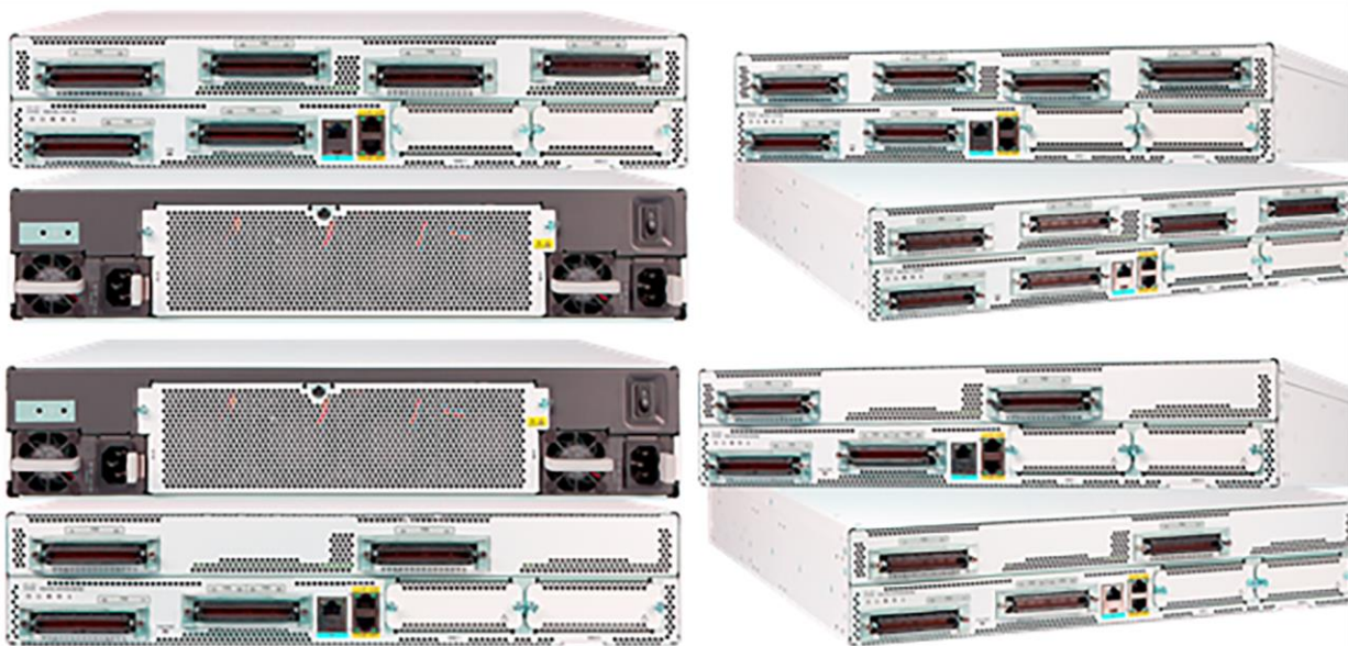
Figure 1. Cisco VG420 High-Density Analog Voice Gateway series

The Cisco® Unified Communications portfolio of voice and IP communications products and applications enables organizations to communicate more effectively, helping them to streamline business processes, reach the right resource the first time, and improve revenue sales and profitability. The Cisco Unified Communications portfolio is a critical part of the Cisco Business Communications Solution, an integrated solution for organizations of all sizes that also includes network infrastructure; security and network management products; wireless connectivity; and a lifecycle services approach, along with flexible deployment and outsourced management options, end-user and partner financing packages, and third-party communications applications.