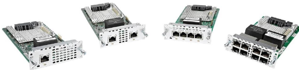
Figure 4. Cisco T1/E1 NIMs compatible with the VG420

The digital T1/E1 voice modules contain a Cisco Packet Voice Digital Signal Processor Module 4 (PVDM4) daughter-board module. A PVDM4 on the T1/E1 module is necessary for TDM voice features. The PVDM4 also provides for echo cancellation of up to 128 ms echo-tail length for demanding network conditions. Figure 4 displays all the digital T1/E1 NIM modules supported in the NIM slots of VG420. Table 4 provides the part numbers and descriptions.