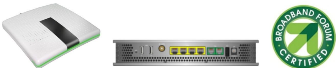
Figure 1. Cisco ME 4600 Series ONTs

Cisco ME 4600 Series customer premises equipment solutions are the right choice for service providers implementing a GPON or Gigabit Ethernet optical access network termination. The access network architecture (Figure 2) supports multiplay service, allowing High Speed Internet (HSI), voice and video services through Ethernet, Wi-Fi, POTS (FXS), and RF overlay standard interfaces. Mobile backhaul and dedicated time-division multiplexing (TDM) based business services are also supported.