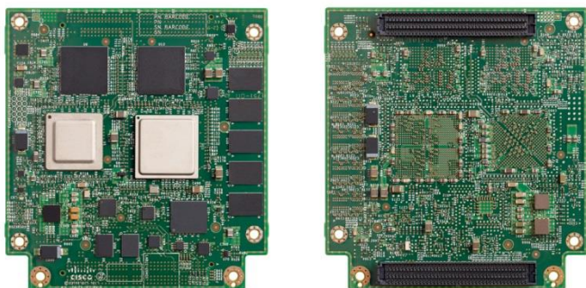
ESS 3300 Mainboard

The Small Form Factor (SFF), board configuration options, and optimized power consumption provide Cisco partners and integrators the flexibility to design custom solutions for defense, oil and gas, transportation, mining, and other verticals. The ESS 3300 runs the trusted and feature-rich Cisco IOS® XE Software, allowing Cisco partners and integrators to offer their customers the familiar Cisco IOS CLI and management experience on their ESS 3300-based solutions.