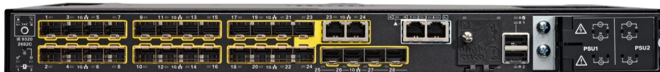
Figure 2. IE-9320-26S2C switch with advanced feature set