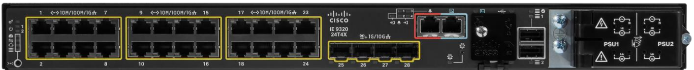
Figure 5. IE-9320-24T4X Switch