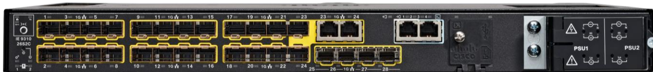
Figure 1. IE-9310-26S2C switch

1 Supported on IE-9320-26S2C and IE-9320-22S2C4X only.