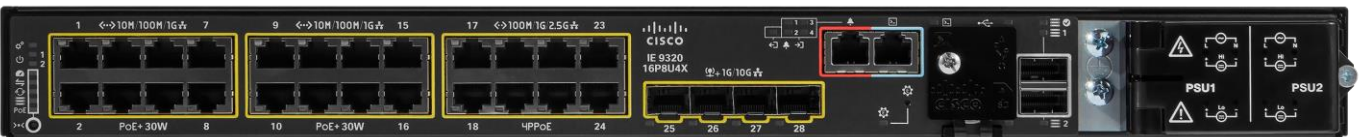
Figure 7. IE-9320-16P8U4X Switch with multi-gigabit and 4PPoE