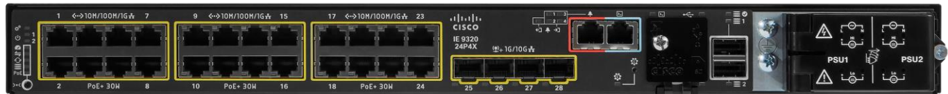
Figure 6. IE-9320-24P4X Switch