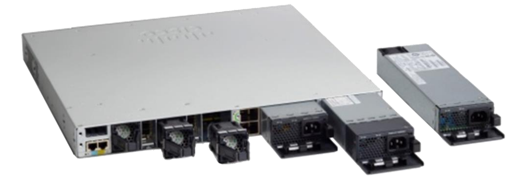
Figure 4. Cisco Catalyst 9300 Series Dual Redundant power supplies

Cisco Catalyst 9300 Series switches support dual redundant power supplies. The switches ship with one power supply by default, and the second power supply can be purchased when the switch is ordered or at a later time. If only one power supply is installed, it should always be in power supply bay #1. The switches also ship with three field-replaceable fans. Power Supplies are common across the Catalyst 9300 Series.