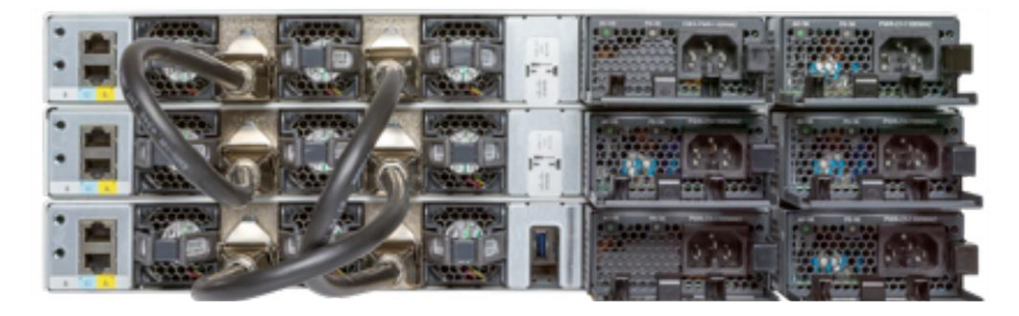
Figure 6. Cisco Catalyst 9300 Series fixed uplink models with optional stack kit