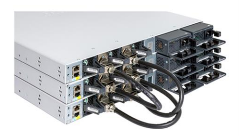
Figure 5. Cisco Catalyst 9300 Series modular uplink models stack (C9300/C9300X SKUs) and fixed uplink models stack (C9300L SKUs)