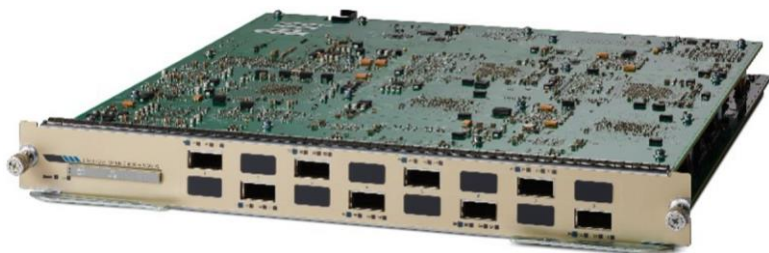
Figure 1. 6800 Series 8-Port 40 Gigabit Ethernet Module