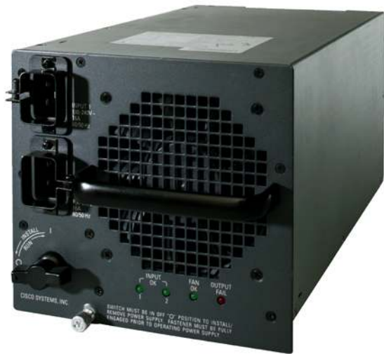
Figure 1. Cisco Catalyst 6500 Series Chassis

All Cisco Catalyst 6500 Series chassis hold up to two load-sharing, fault-tolerant, hot-swappable power supplies. Only one supply is required to operate a fully loaded chassis. If a second supply is installed, it operates in a load-sharing capacity. The power supplies are hot-swappable—a failed power supply can be removed without powering off the system.