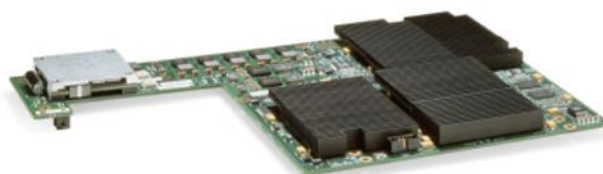
Figure 4. The Optional Field-Upgradeable for use with CEF720 Class Interface Modules

** Queues Legend: 1p3q1t = 1 priority queue, 3 round robin queues, 1 threshold. For optimal performance, Cisco recommends using a distributed forwarding card