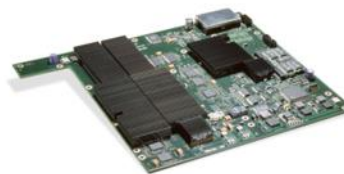
Optional field-upgradeable Distributed Forwarding Card (DFC)