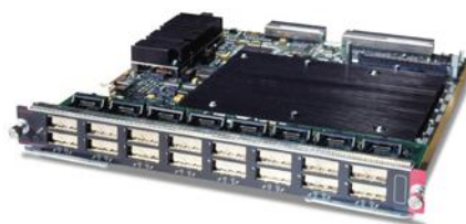
16 Port GBIC-Based Module