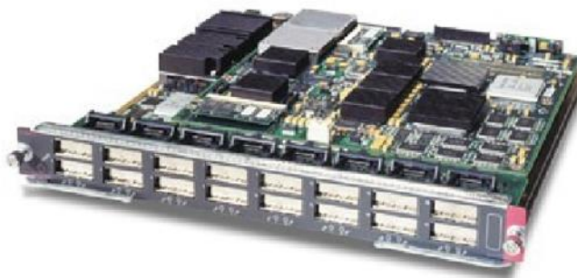
Figure 5. dCEF256 Gigabit Ethernet Optical Interface Modules WS-X6816-GBIC