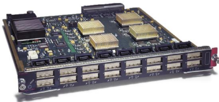
Figure 7. Classic Gigabit Ethernet Optical Interface Module WS-X6416-GBIC