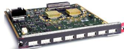
8 Port GBIC-Based Module

Designed to complement the many roles that the Cisco Catalyst 6500 Series plays in a network, Cisco Catalyst 6500 Series mixed media Gigabit Ethernet modules offer the broadest selection of media, densities, performance, interoperability, and chassis deployments for enterprises and service providers. These modules are ideal for gigabit Ethernet over fiber to the desktop, gigabit uplinks, aggregation of high-density 10/100 interfaces, Metro Ethernet, backbone and high-speed server farm or data center connections as well as mixed media environments supporting both fiber and copper cable connections. The Cisco Catalyst 6500 Series Gigabit Ethernet modules offer: