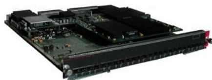
24 Port SFP-Based Module