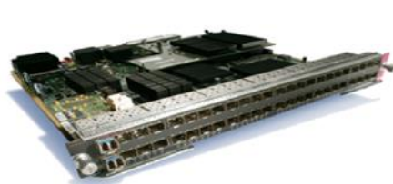
48 Port SFP-Based Module