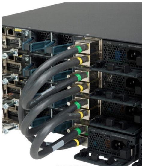
Figure 3. StackPower Connector

The Cisco Catalyst 3750-X Series introduces Cisco StackPower technology, innovative power interconnect system that allows the power supplies in a stack to be shared as a common resource among all the switches. Cisco StackPower unifies the individual power supplies installed in the switches and creates a pool of power, directing that power where it is needed. This feature is available in all Cisco Catalyst 3750-X Series Switches feature sets*. Up to four switches can be configured in a StackPower stack with the special connector at the back of the switch using the StackPower cable**, which is different than the StackWise cables. (See Figure 3.)