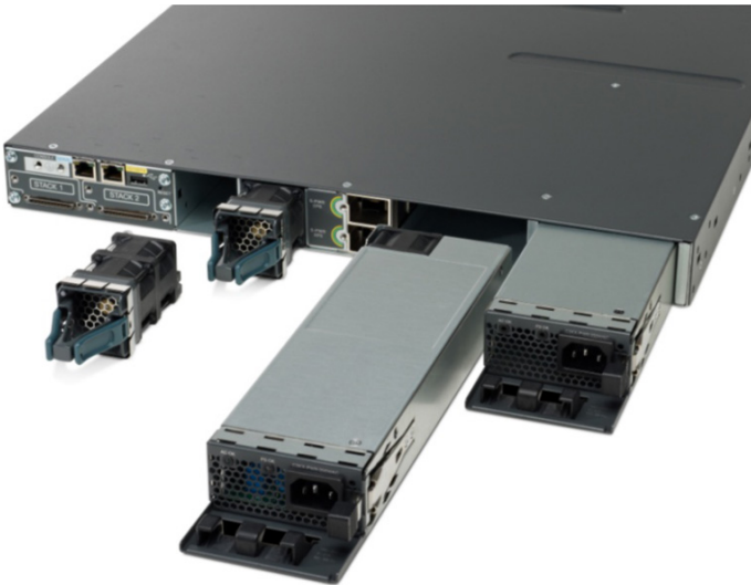
Figure 5. Dual Redundant Power Supplies

The Cisco Catalyst 3750-X Series and 3560-X Series Switches support dual redundant power supplies. The switch ships with one power supply by default, and the second power supply can be purchased at the time of ordering the switch or at a later time. If only one power supply is installed, it should always be in the power supply bay 1. (See Figure 5).