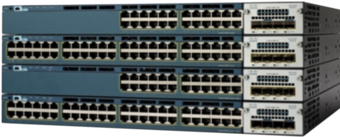
Figure 2. Cisco Catalyst 3560-X Series Switches

Figure 2 shows Cisco Catalyst 3560-X Series Switches.