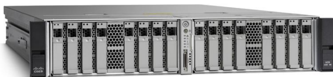
Figure 1. Cisco UCS C420 M3 Rack Server