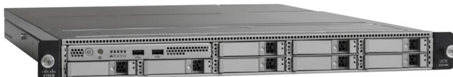
Figure 1. Cisco UCS C22 M3 Server

The Cisco UCS C22 M3 server interfaces with Cisco UCS using another unique Cisco® innovation: the Cisco UCS Virtual Interface Card 1225 (VIC 1225). The Cisco UCS VIC 1225 is a virtualization-optimized Fibre Channel over Ethernet (FCoE) PCIe 2.0 x8 10-Gbps adapter designed for use with Cisco UCS C-Series servers. The VIC is a dual-port 10 Gigabit Ethernet PCIe adapter that can support up to 256 PCIe standards-compliant virtual interfaces, which can be dynamically configured so that both their interface type (network interface card [NIC] or host bus adapter [HBA]) and identity (MAC address and worldwide name [WWN]) are established using just-in-time provisioning. In addition, the Cisco UCS VIC 1225 can support network interface virtualization and Cisco Data Center Virtual Machine Fabric Extender (VM-FEX) technology.