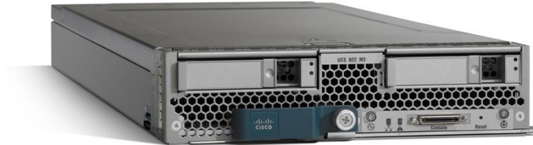
Figure 1. Cisco UCS B22 M3 Blade Server

The Cisco UCS B22 M3 further extends the capabilities of Cisco UCS by delivering new levels of manageability, price-to-performance metrics, energy efficiency, reliability, security, and I/O bandwidth for enterprise-class applications.