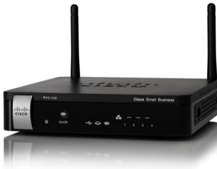
Figure 1. Cisco RV215W Wireless-N VPN Router

The Cisco® RV215W Wireless-N VPN Router provides simple, affordable, highly secure, business-class connectivity to the Internet from small and home offices and remote locations.