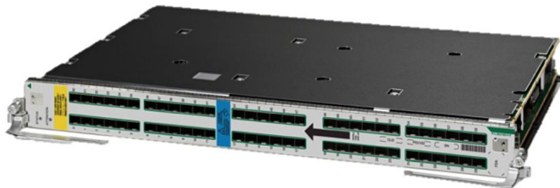
Figure 1. Cisco NCS 6000 Series 60-Port 10Gbps LSR Line Card with SFP+ Optics

The Cisco NCS 6000 Series is engineered for environmental efficiency by offering an adaptable power-consumption model for its ASICs, and the use of revolutionary complementary metal-oxide semiconductor (CMOS) photonics technology. With these technologies together, the Cisco NCS 6000 Series can offer a highly power-efficient footprint for service provider routing.