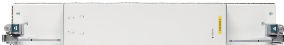
Figure 2. Cisco ASR 9910 Switch Fabric Card 3