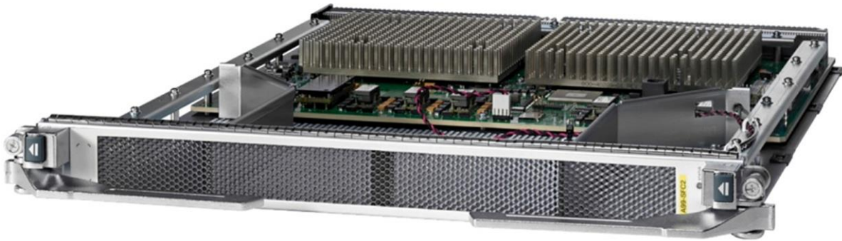
Figure 1. Cisco ASR Switch Fabric Card 2

The Cisco ASR 9900 Switch Fabric Card 2 (Figure 1), Switch Fabric Card S (Figure 2) and Switch Fabric Card T (Figure 3) are the next-generation switch fabrics for the Cisco ASR 9922 Router, ASR 9912 Router, ASR 9910 Router and ASR 9906 Router, supporting high-density 100 Gigabit Ethernet line cards. The system architecture of the Cisco ASR 9900 Switch Fabric Card 2 (ASR 9900 SFC2), Switch Fabric Card S (ASR 9900 SFC-S) and Switch Fabric Card T (ASR 9900 SFC-T) is designed to accommodate new programmable deployment models and convergence of Layer 2 and Layer 3 services, as required by today's wireline, Data-Center-Interconnect (DCI), and Radio Access Network (RAN) aggregation applications.