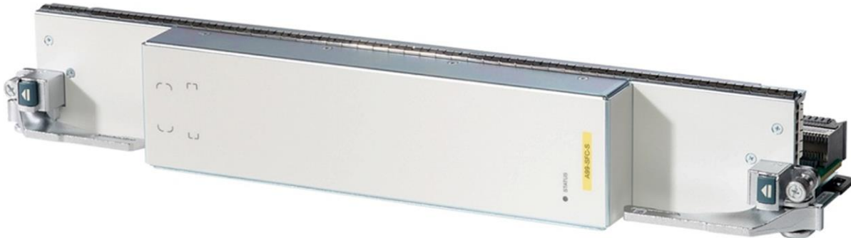
Figure 2. Cisco ASR Switch Fabric Card S