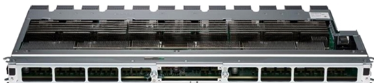
Figure 18. Cisco 8800 fabric card

The Cisco 8800 Series switch fabric is powered by 8 fabric cards that provide 7+1 line rate redundancy. In addition, the fabric supports a separate operational model with 4+1 fabric card redundancy to provide an entry level option for systems with only the 48-port 100GbE line card. This mode reduces cost and power for networks that want to take advantage of the latest platforms but are not yet ready to broadly deploy 400GbE.