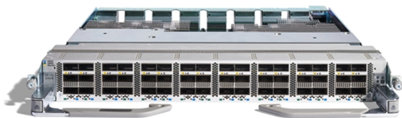
Figure 17. 34 - port QSFP28 100GbE and 14 - port QSFP56-DD 400GbE

In addition, there is a combo card that provides 34 - QSFP28 ports and 14 - QSFP56-DD ports. It offers customers the ability to smoothly transition from 100G to 400G. For additional flexibility, this card supports MACsec on 16 of the 100GbE ports.