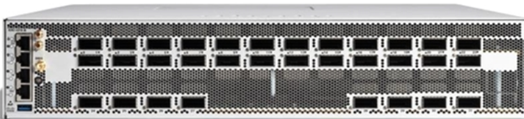
Figure 11. Cisco 8202-32FH-M

The Cisco 8200 Series is designed for roles requiring higher scale and external deep buffers. To achieve similar routed bandwidth and scale, other industry routers require multiple devices such as off-chip Ternary Content-Addressable Memory (TCAMs), fabric ASICs, and multiple network processors. However, the Cisco 8200 Series routers use a simple single ASIC (with HBM) design without the need for off-chip TCAM.