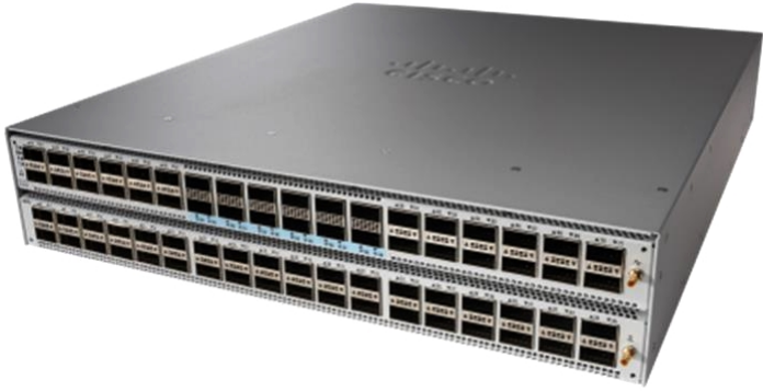
Figure 8. Cisco 8202-SYS