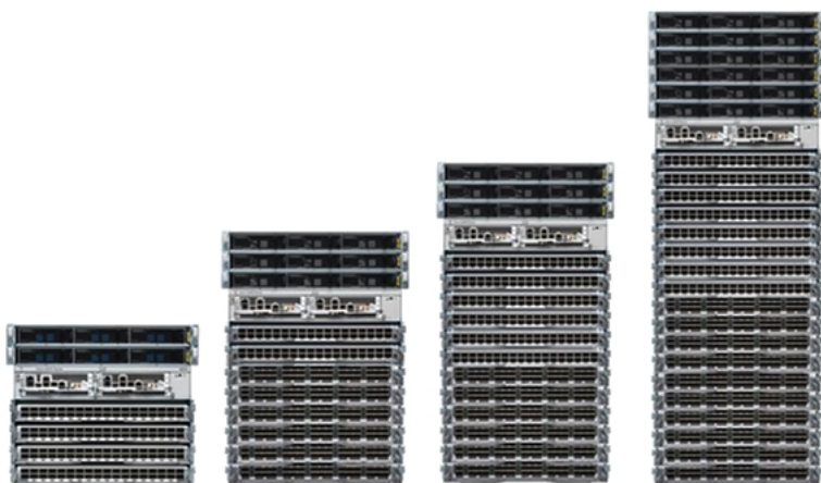
Figure 12. Cisco 8800 4-, 8-, 12-, and 18-slot modular chassis

With up to 518.4 Tbps via 648 800G (2x 400GbE) ports, the Cisco 8800 Series delivers industry leading breakthrough density and efficiency with the extensive scale, buffering, and feature capabilities common to all the Cisco 8000 Series of routers. It includes four chassis – the 8804, 8808, 8812, and 8818 – to meet a broad set of network and facility requirements.