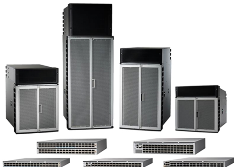
Figure 1. Cisco 8000 Series routers

High-performance networking systems have historically been divided into routing or switching classes, with distinct hardware and software. Over time, this distinction has become less pronounced. This convergence has occurred with the evolution of feature-rich switching chips and routing chips that balance traditional Service Provider (SP)-class capabilities with many benefits of switching Application-Specific Integrated Circuits (ASICs).