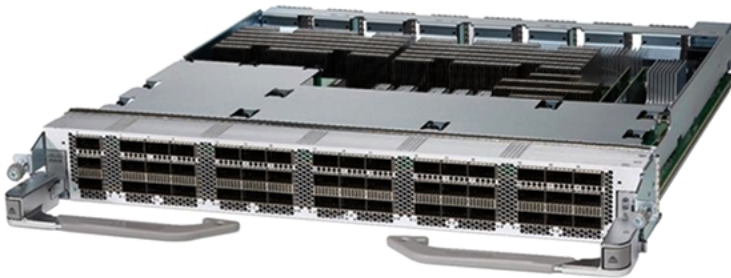
Figure 13. 48-port QSFP28 100GbE line card

The 48-port QSFP28 100GbE line card provides 4.8 Tbps of throughput with MACsec support on all ports. It also supports QSFP+ optics for 10G and 40G compatibility.