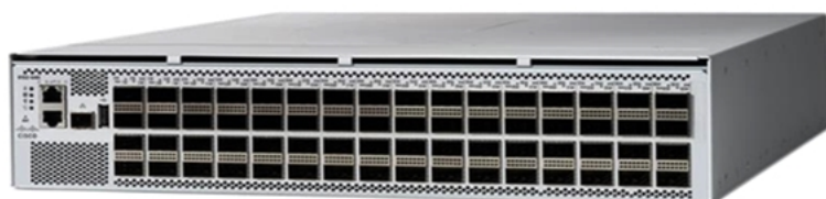
Figure 3. Cisco 8102-64H-O