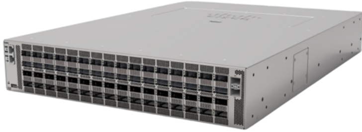
Figure 6. Cisco 8122-64EH-O

The Cisco 8100 Series extends the small footprint, low power, and high performance of the 8000 Series to data center fabric roles that do not require the expanded forwarding scale and deep buffering of the 8200 Series.