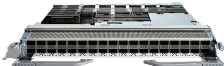
Figure 16. 36-port QSFP-DD800 800G line card

The 36-port QSFP-DD800 800G line card provides 28.8 Tbps of throughput. Each 800G port can be used as 2x400GbE ethernet or 8x100GbE ethernet.