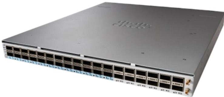
Figure 7. Cisco 8201-SYS