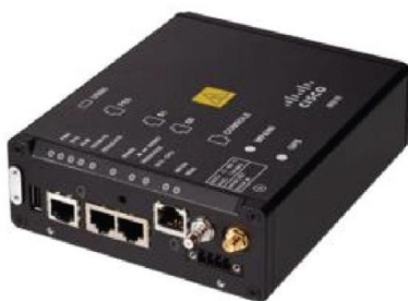
Figure 1. Cisco IR510

Figure 1 displays a Cisco WPAN Industrial Router IR510.