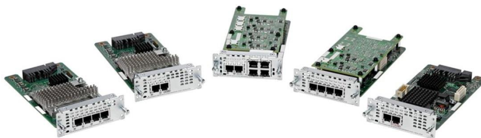
Table 1. Cisco FXO and FXS NIM Types and Feature Comparison