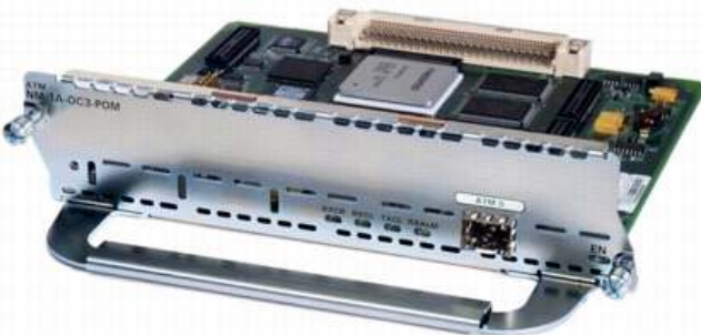
Figure 1. Cisco 3800 and 3900 Series ATM OC-3 Network Module

Cisco IOS SP Services feature sets are required to support ATM. A maximum of one ATM OC-3 network module is recommended on the Cisco 3825 and Cisco 3925, and a maximum of two ATM OC-3 network modules are recommended on the Cisco 3845 and Cisco 3945