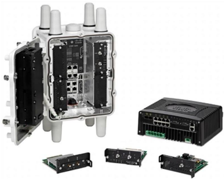
Figure 1. Cisco 1000 Series connected grid routers

The Cisco CGR 1000 Series includes two platforms, shown in Figure 1: The Cisco 1120 Connected Grid Router (CGR 1120), which is designed for indoor deployments; and the Cisco 1240 Connected Grid Router (CGR 1240), which is a weatherproof router in a NEMA Type 4 enclosure for outdoor deployments.