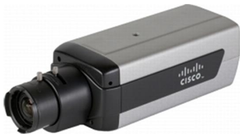
Figure 1. Cisco Video Surveillance 6000P IP Camera

The Cisco Video Surveillance 6000P IP Camera offers a variety of benefits, including: