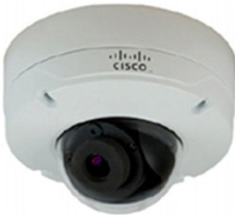
Figure 1. Cisco Video Surveillance 3530 IP Camera

The Cisco Video Surveillance 3530 IP Camera offers a variety of benefits, including: