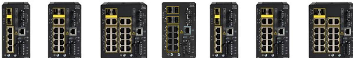
Figure 1. IE-3100 Rugged Series switches models