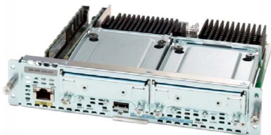
Figure 1. Cisco SRE Module

Cisco WAAS is a comprehensive WAN optimization and application acceleration solution that is a crucial component of Cisco Borderless Networks and data center and virtualization architectures. It accelerates applications and data over the WAN, optimizes bandwidth, empowers cloud computing, and provides local hosting of branch IT services, all with industry-leading network integration.