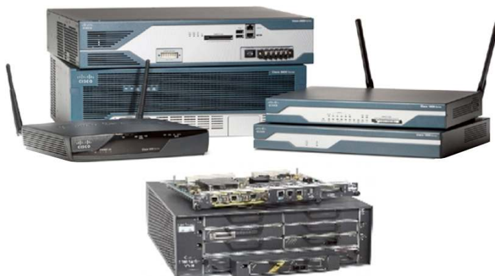
Figure 1. Cisco 800, 1800, 2800, and 3800 Series Integrated Services Routers, and Cisco 7200VXR Series Services Aggregation Routers

One of the many architectural enhancements specific to the next-generation integrated services routers as well as the Cisco 7200VXR Series Services Aggregation Routers is the integration of USB ports. Two new features are available to take advantage of these USB ports: USB eToken device support and USB flash support. A USB is a low-cost, bidirectional, dynamically attachable serial interface.