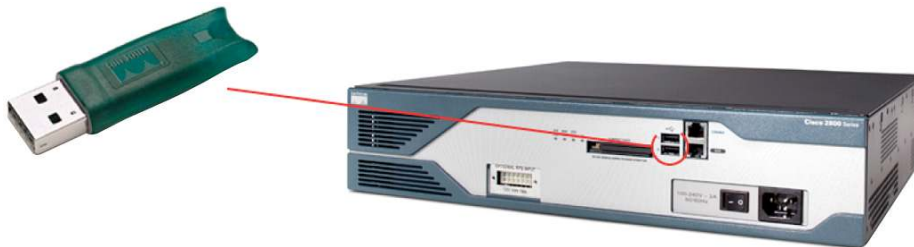
Figure 2. Cisco 2851 Integrated Services Router with Two USB Ports; SafeNet, Inc. eToken Devices

You can use the USB eToken device to store files - it can store any file that you need to store securely and that can fit on the eToken device. The eToken device can store X.509 digital certificates as well as configuration files. You can transfer these files from the router to the eToken device with a Cisco IOS ® Software command-line interface (CLI) command or by using a GUI-based software application called Token Management System (TMS), which is available from SafeNet, Inc. For more information about TMS or to order eToken devices, please visit: http://www.safenet-inc.com/About/ContactUs/Default.aspx?id=119 .